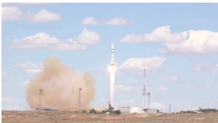
Launching of the Soyuz

WNISAT-1R was confirmed in good condition and no initial failure has been found.