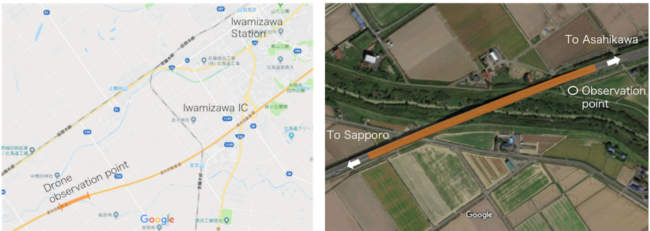
Figure 3: Drone observation area

Although Weathernews has used drones for weather observations in the past, this was the first time we have used them to observe road surface conditions. We plan to continue to expand our use of drones in the future, gathering and analyzing new data to support optimal highway management.