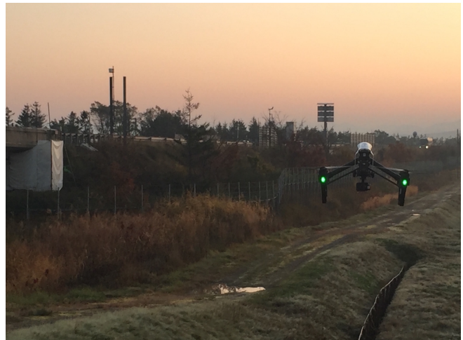
Figure 4: An observation drone in action

Although Weathernews has used drones for weather observations in the past, this was the first time we have used them to observe road surface conditions. We plan to continue to expand our use of drones in the future, gathering and analyzing new data to support optimal highway management.