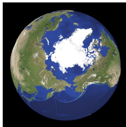
Image of the sea ice area in the minimum period of this summer (This year shows a similar trend to the area of the minimum period of 2017. Original analysis image using AMSR2)

Also, as regards the Northwestern Passage on the Canadian side, the melting of sea ice in the Beaufort Sea to the north of Alaska is progressing, but much sea ice still remains in the Canadian Archipelago. As it will require time for this ice to melt, the period of opening is likely to be mid-September.