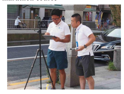
Aug. 2nd - View of mobile observations at the 15 km point on the marathon course

The marathon course observations conducted on August 2nd also served as a verification of this prediction model, and observation staff were divided into two groups: the Sports Weather Team's Mobile Observation Team and a Fixed-point Observation Team comprising the Forecast Center and the University of Tsukuba.