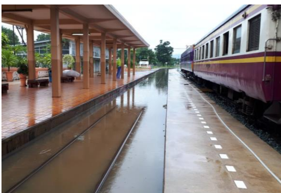
Flooding due to heavy rain at Den Chai Station, northern Thailand