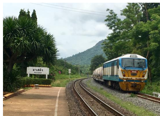
A train approaching Pha Sadet Station, northeastern Thailand

*About the State Railway of Thailand (SRT)