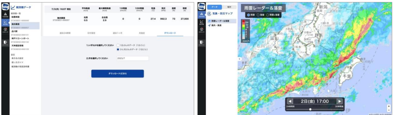
PC version: (Left) Observation data download screen (Right) Raincloud radar

The monthly usage fee for applications for PC version is included in the rental or purchase price of “Soratena Pro,” and up to three application accounts per Soratena will be granted free of charge.