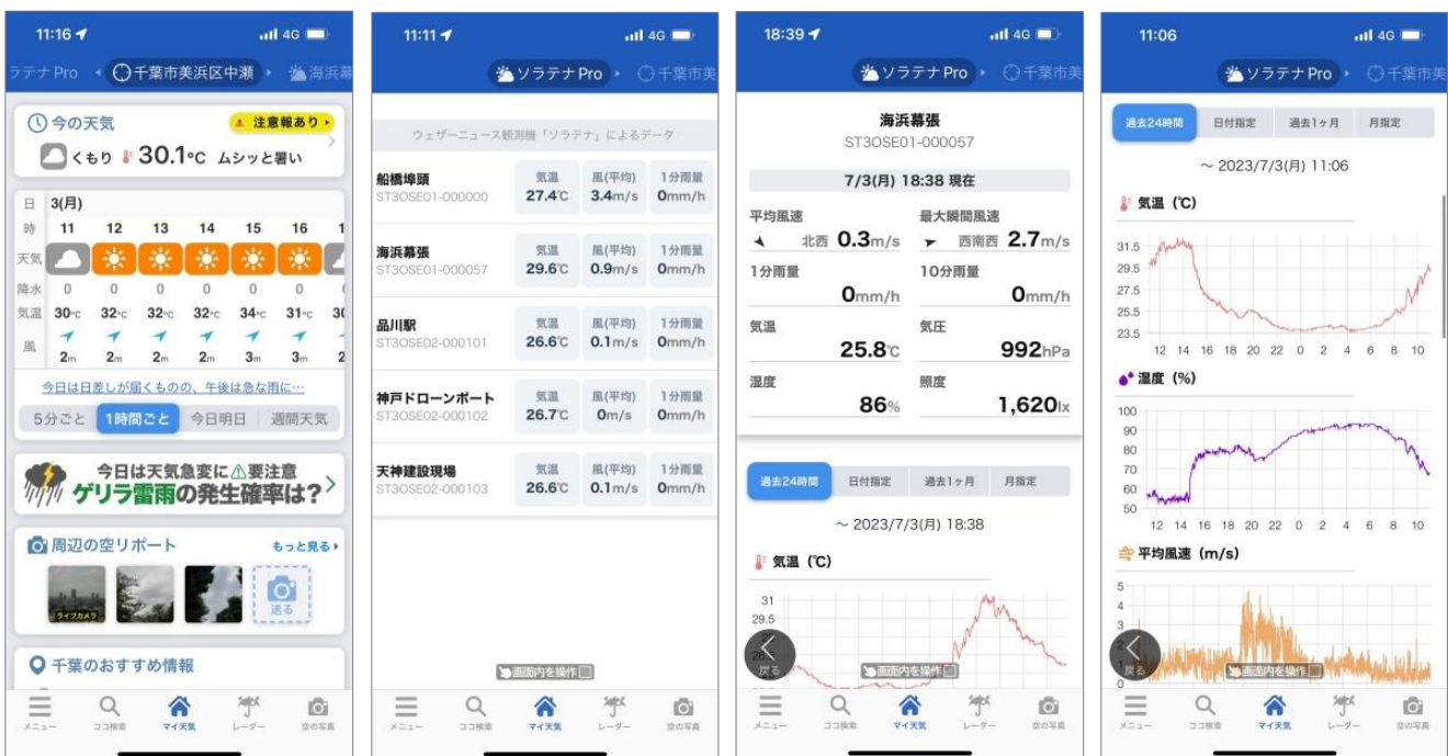
Dedicated observation page appears on My Weather

In order to make it easier for you to incorporate observation data into your business, Weathernews has linked "Soratena Pro" with the "weathernews" application which boasts a cumulative total of 35 million downloads and has the highest weather forecast accuracy. This allows you to use the weather application that is used by many users on a daily basis without changing anything for your business. Just by logging in with your company account, a dedicated page will be displayed on the top page "My Weather".