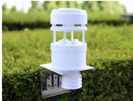
New weather IoT sensor "Soraten Pro"