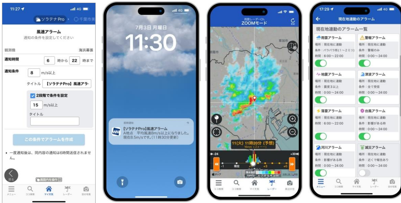
Push notification: (Left) Setting screen, (Right) Wind velocity alarm

On the dedicated page, seven types of observation data can be viewed in real time and past data can be checked in graphs. Furthermore, push notifications will be sent out when the observed value exceeds the threshold value. Users can select two elements from air temperature, rainfall amount, and wind velocity, and set the thresholds and titles. By predetermining actions to be taken in response to notifications, companies can respond quickly to heavy rain, strong winds, and high/low air temperatures.