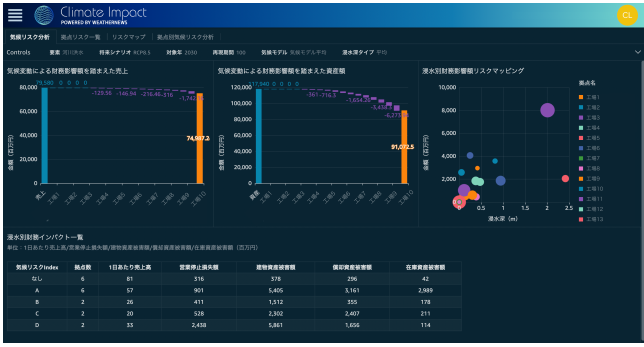
Climate Change Risk Analysis Services